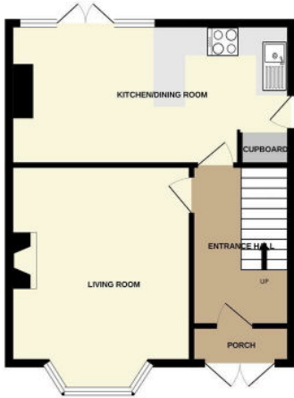
GROUND FLOOR 479 sq.ft. (44.5 sq.m.) approx.