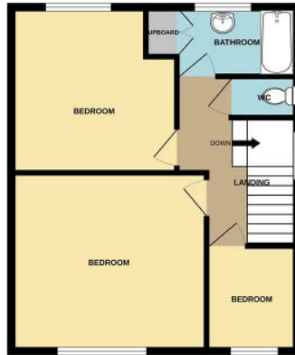
1ST FLOOR 479 sq.ft. (44.5 sq.m.) approx.