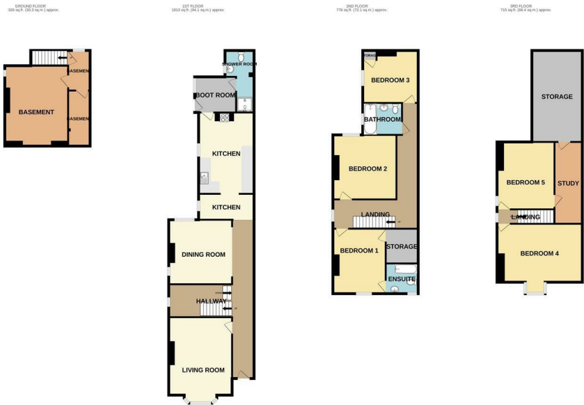
TOTAL FLOOR AREA : 2830 sq.ft. (262.9 sq.m.) approx. Whilst every attempt has been made to ensure the accuracy of the floorplan contained herein, measurements of doors, windows, rooms and any other items are approximate and no responsibility is taken for any error, omission or mis-statement. This plan is for illustrative purposes only and should be used as such by any prospective purchaser. The services, systems and appliances shown have not been tested and no guarantee as to their operability or efficiency can be given. Made with Metropex ©2023