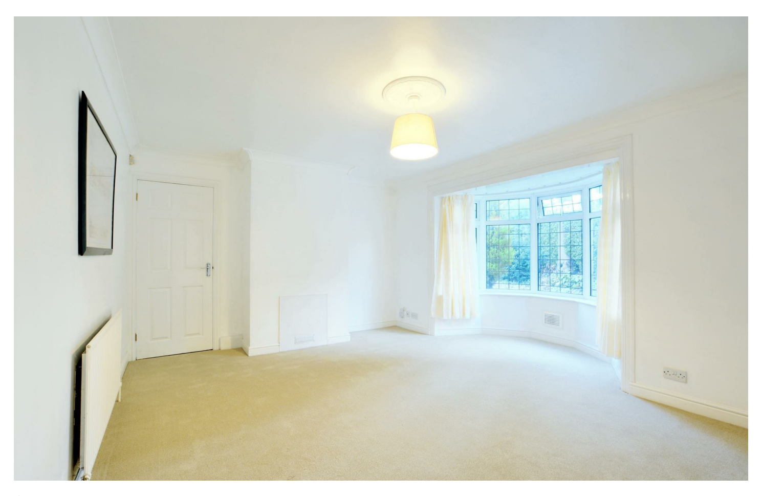
A spacious two bedroom detached bungalow with a detached garage.

Situated in a quiet and peaceful cul-de-sac, well placed for a range of local shops and amenities including, schools, healthcare facilities, transport links and Wollaton Hall and Deer Park, this wonderful bungalow is considered an ideal opportunity for a variety of incoming purchaser including those looking to downsize locally or to relocate to this desirable location.