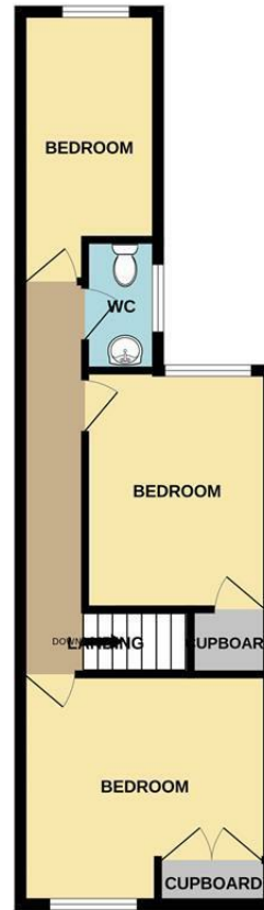
1ST FLOOR 443 sq.ft. (41.2 sq.m.) approx.