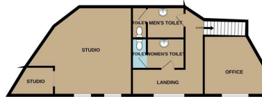
1ST FLOOR 696 sq.ft. (64.7 sq.m.) approx.