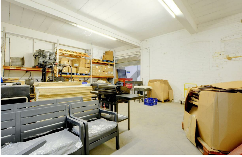
A COMMERCIAL LOCK-UP STORAGE UNIT

Unit B, Main Street, Long Eaton, Nottingham NGI0 IGN