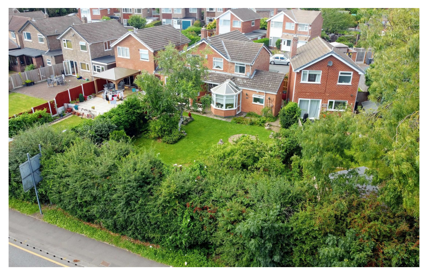
An Extended Four-Bedroom Detached House with the Benefit of a Garage.

Situated in this sought-after and convenient residential location within easy reach of a variety of local shops and amenities including schools, transport links, Chilwell Retail Park and Attenborough Nature Reserve this fantastic property is considered an ideal opportunity for a range of potential purchasers including; young professionals and families.