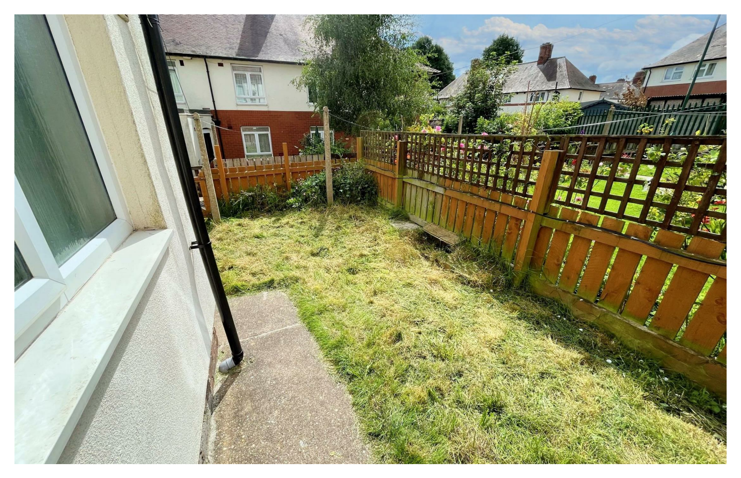
***IDEAL INVESTMENT ******Guide Price £60,000 - £70,000***Robert Ellis Estate Agents are pleased to bring to the market this ONE-bedroom ground floor MAISONETTE.

The property is situated towards the end of a CUL-DE-SAC with excellent access to the NOTTINGHAM RING ROAD and the A6002 to NOTTINGHAM CITY CENTRE and a short drive to Hucknall and Bulwell town centres.