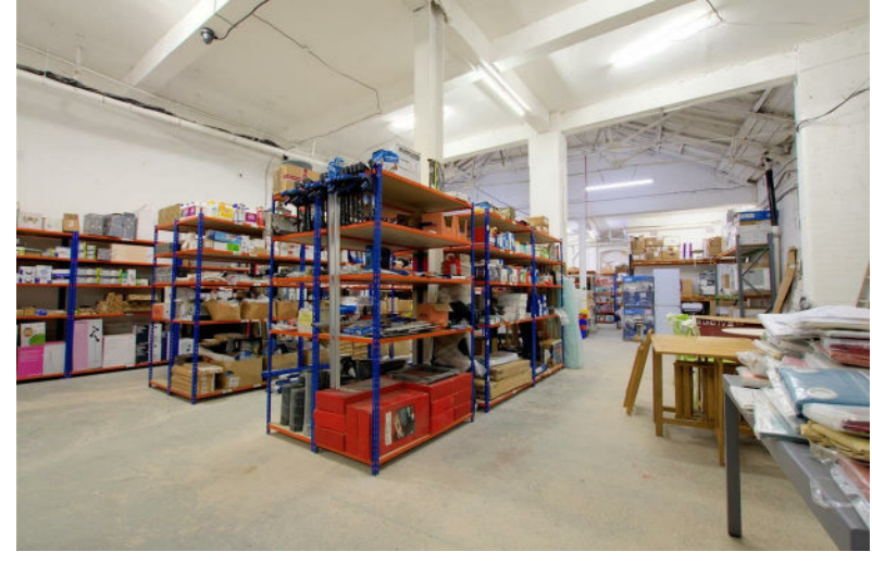
A COMMERCIAL LOCK-UP STORAGE UNIT

Unit A, Main Street, Long Eaton, Nottingham NGI0 IGN