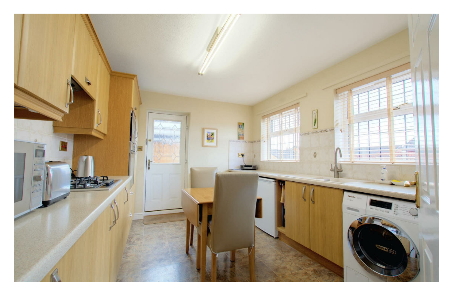
THIS IS AN IMMACULATELY MAINTAINED THREE DOUBLE BEDROOM DETACHED BUNGALOW SITUATED ON A QUIET CUL-DE-SAC IN THIS MOST SOUGHT AFTER VILLAGE LOCATION.

Robert Ellis are pleased to be instructed to market this three double bedroom detached bungalow which is being sold with the benefit of NO UPWARD CHAIN. The property has been highly maintained throughout and it is ready for people to move into straight away without having to carry out any work whatsoever. For the extent of the accommodation and the privacy of the rear garden to be appreciated, we recommend that interested parties do take a full inspection so they can see all that is included in this lovely property for themselves. The property is located on the edge of Breaston village which is a very popular semi rural location situated between Nottingham and Derby, which provides a number of local amenities and facilities and is close to excellent transport links, all of which have helped to make this a very popular and convenient place for people to live.