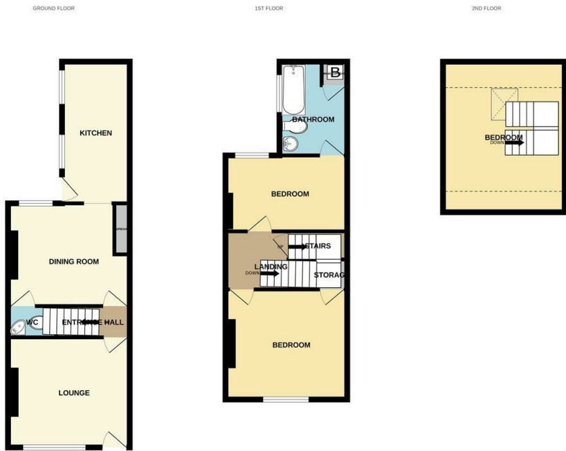
18 CONWAY STREET, LONG EATON

Whilst every attempt has been made to ensure the accuracy of the floorplan contained here, measurements of doors, windows, rooms and any other items are approximate and no responsibility is taken for any error, omission or mis-statement. This plan is for illustrative purposes only and should be used as such by any prospective purchaser. The services, systems and appliances shown have not been tested and no guarantee as to their operability or efficiency can be given. Made with Metropac C5023